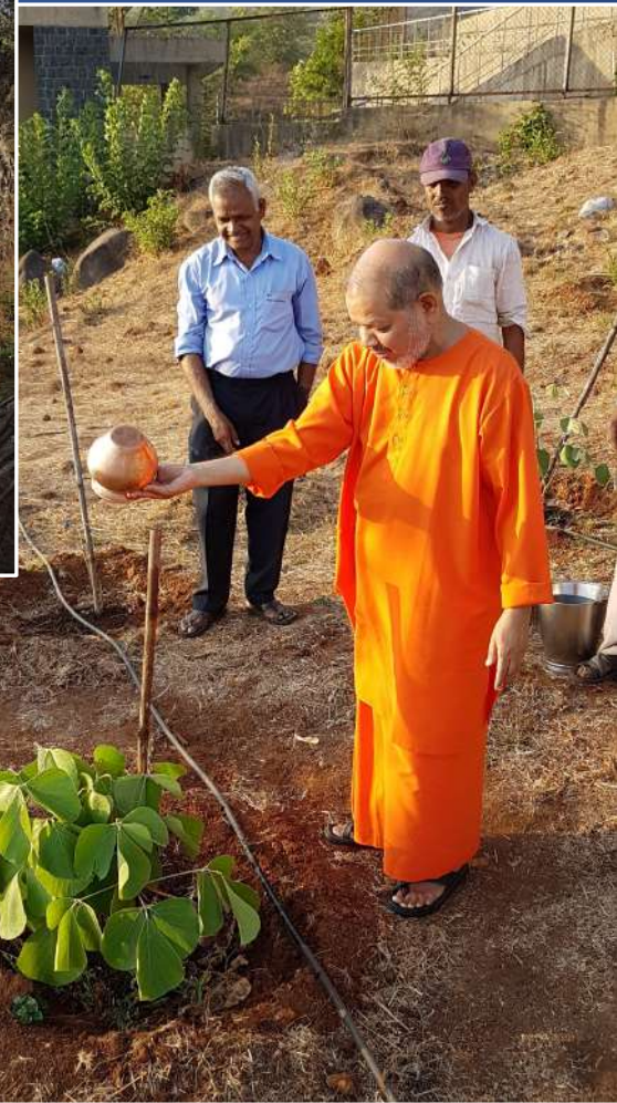
May 2019 Swami Tejomayananda tried out the new Dhyan Vatika ramp & pathway, and visited & tended to trees