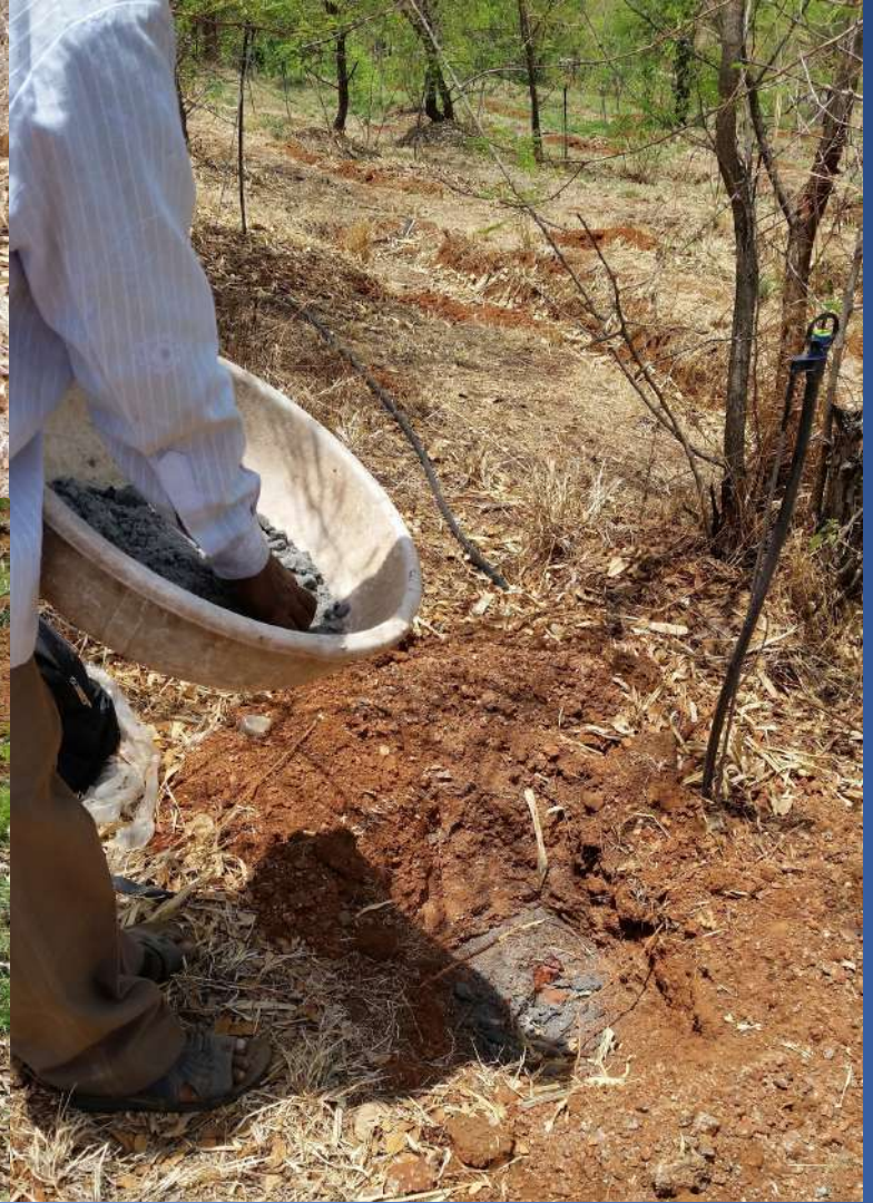
April 2017 Preparation of pits for plantation