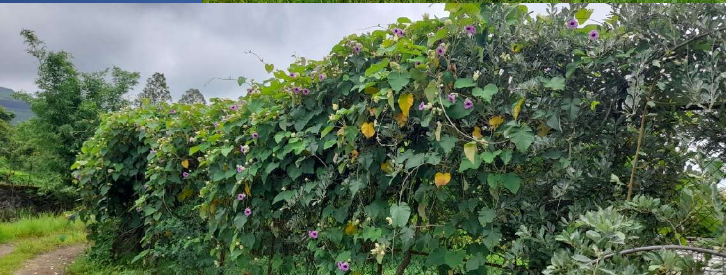
July 2021 Climbers on the Swanubhooti Vatika boundary fence