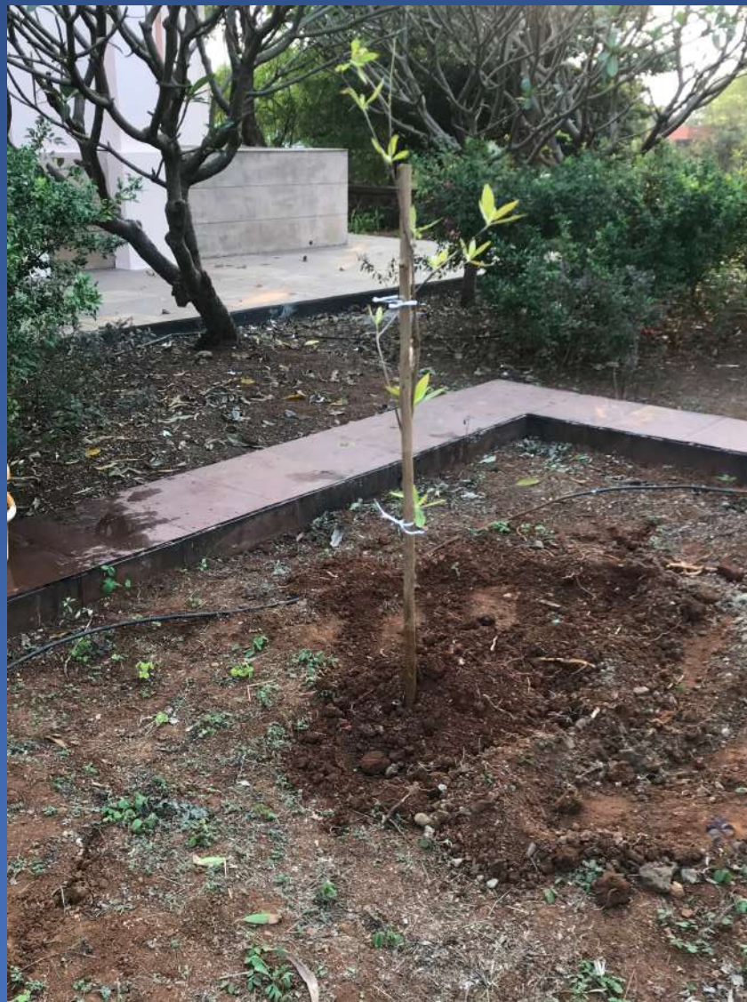
December 2020 Rudraksha tree near Chinmaya Maruti Mandir