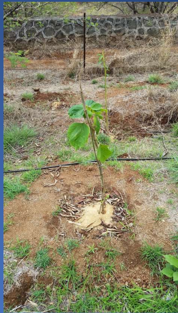
June 2017 Progress after a few weeks