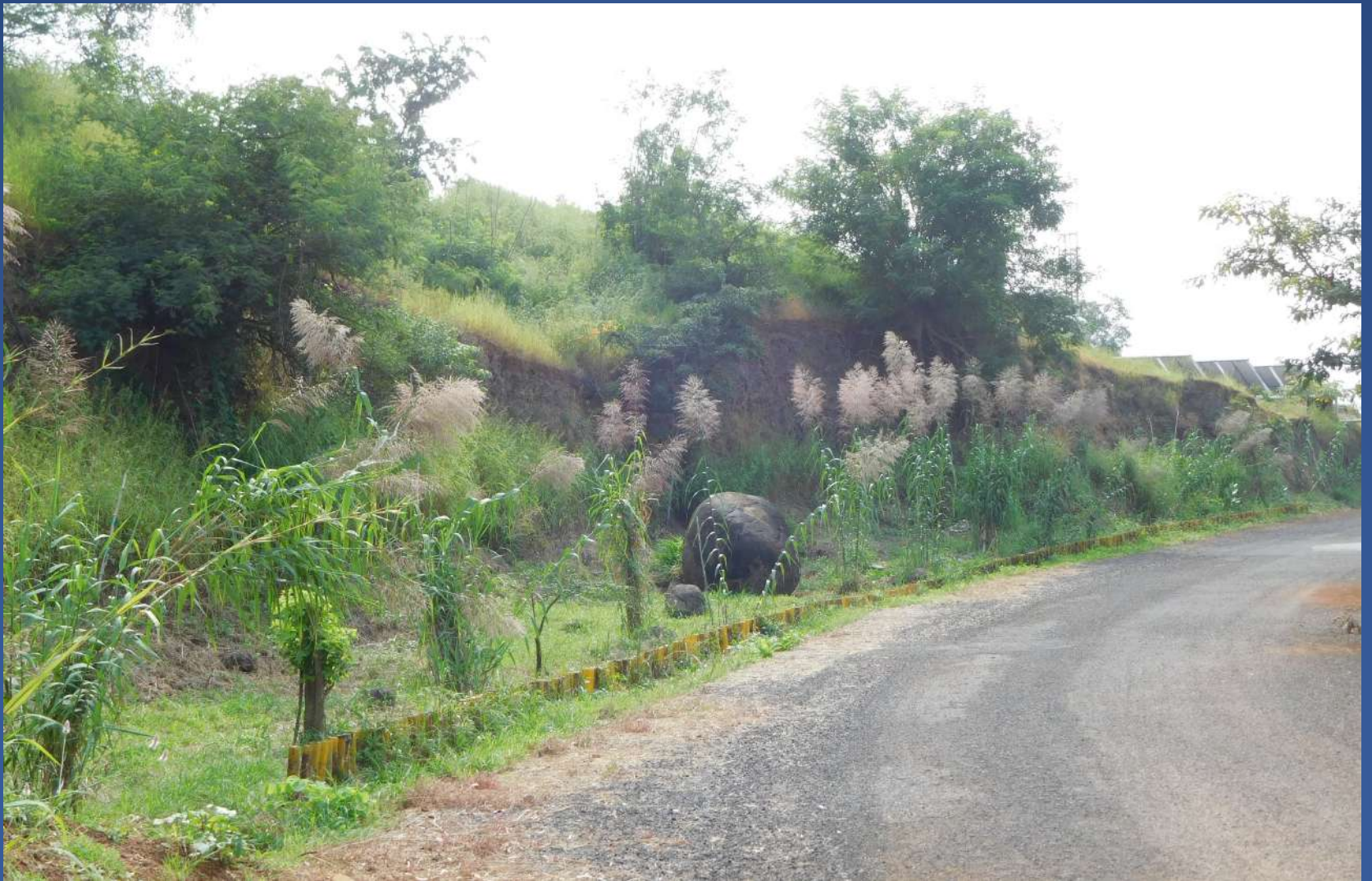
September 2018 Pencil Bamboos behind Rituraj, en route Pranav Ganesh Mandir