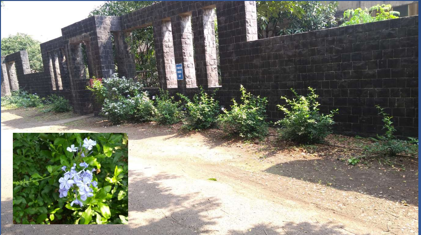
September 2018 Chitrak (Leadwort) plants near Krishnadas staff quarters