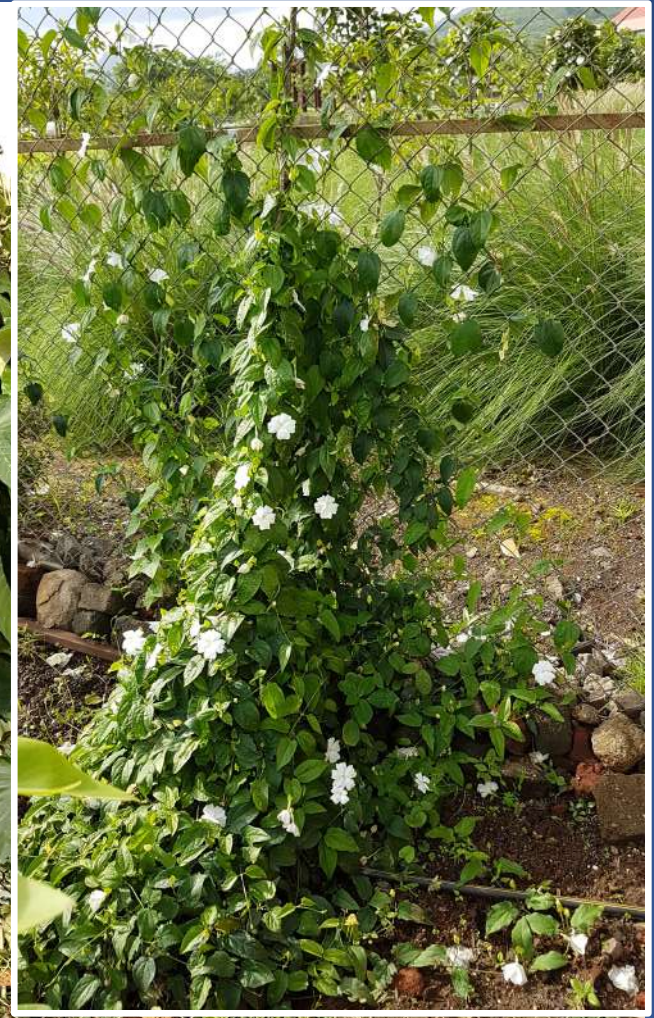
September 2018 Climbers on the Swanubhooti Vatika boundary fence