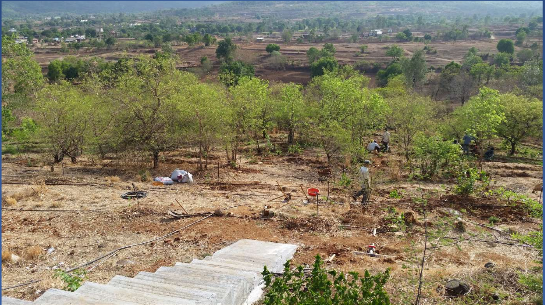
April 2017 Laying of water sprinklers