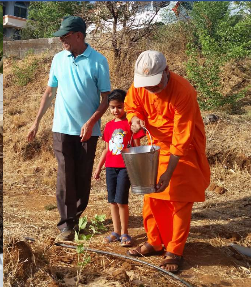
28 May 2017 Plantation of trees by Swami Tejomayananda during inauguration of Dhyān Vatika